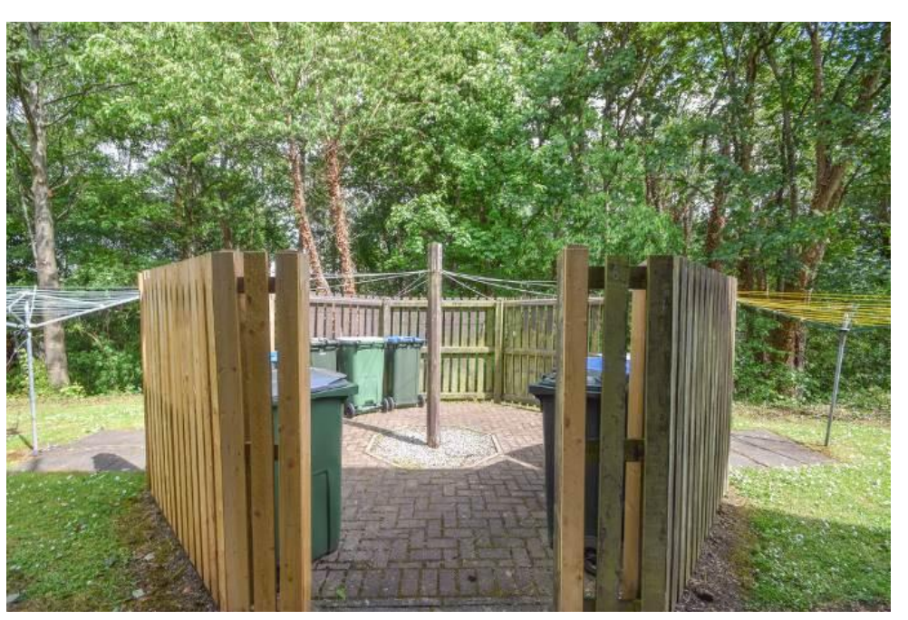
Next Home - 31 Fechney Park, Perth, PH1 1PT