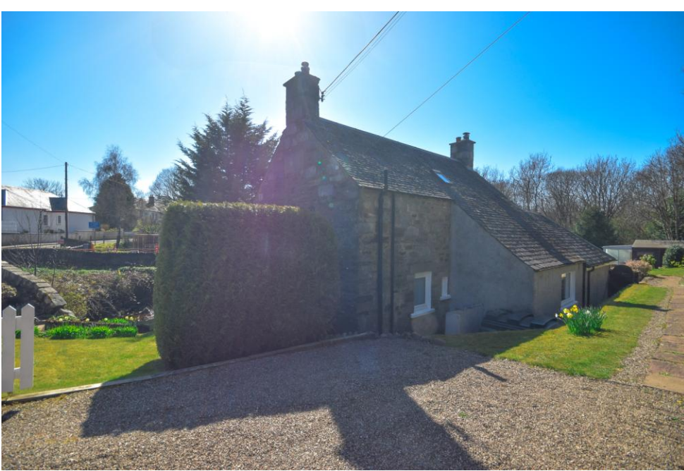
Next Home - Glen Forres, Edradour, Pitlochry, PH16 5JP