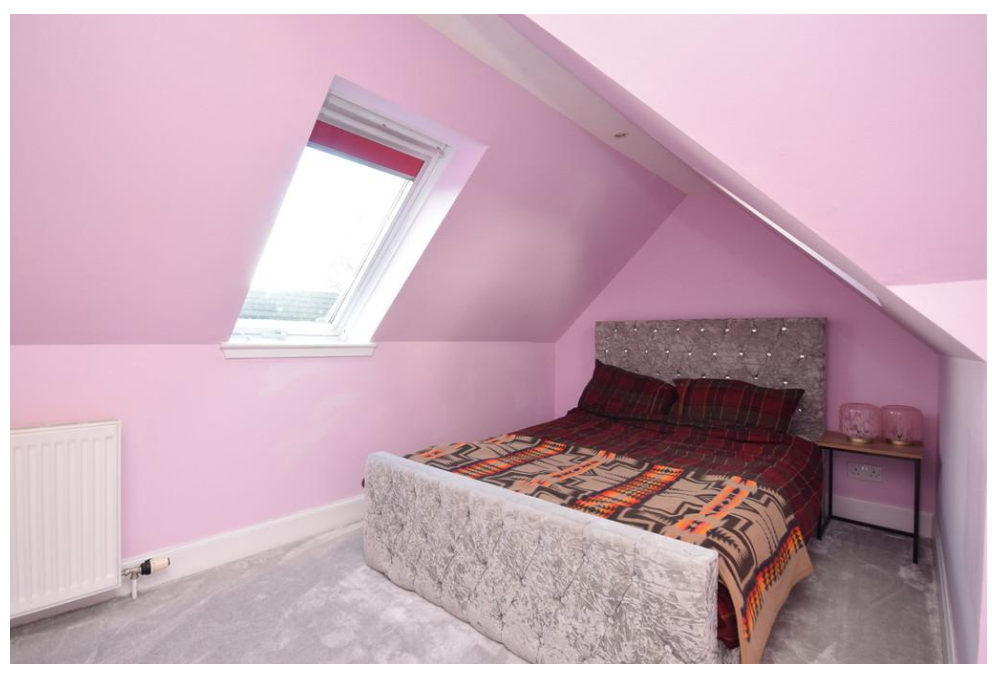
Next Home - Kings Lynn, Stirling Street, Blackford, Auchterarder, PH4 1QG