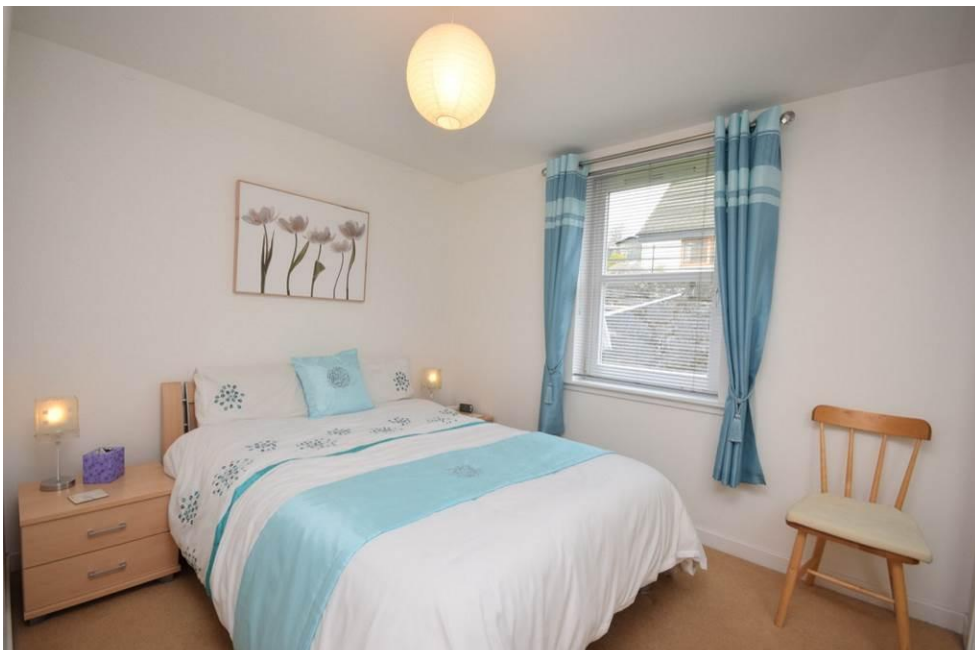
15 Dean Court, Pitlochry, PH16 5NW - Bedroom 2