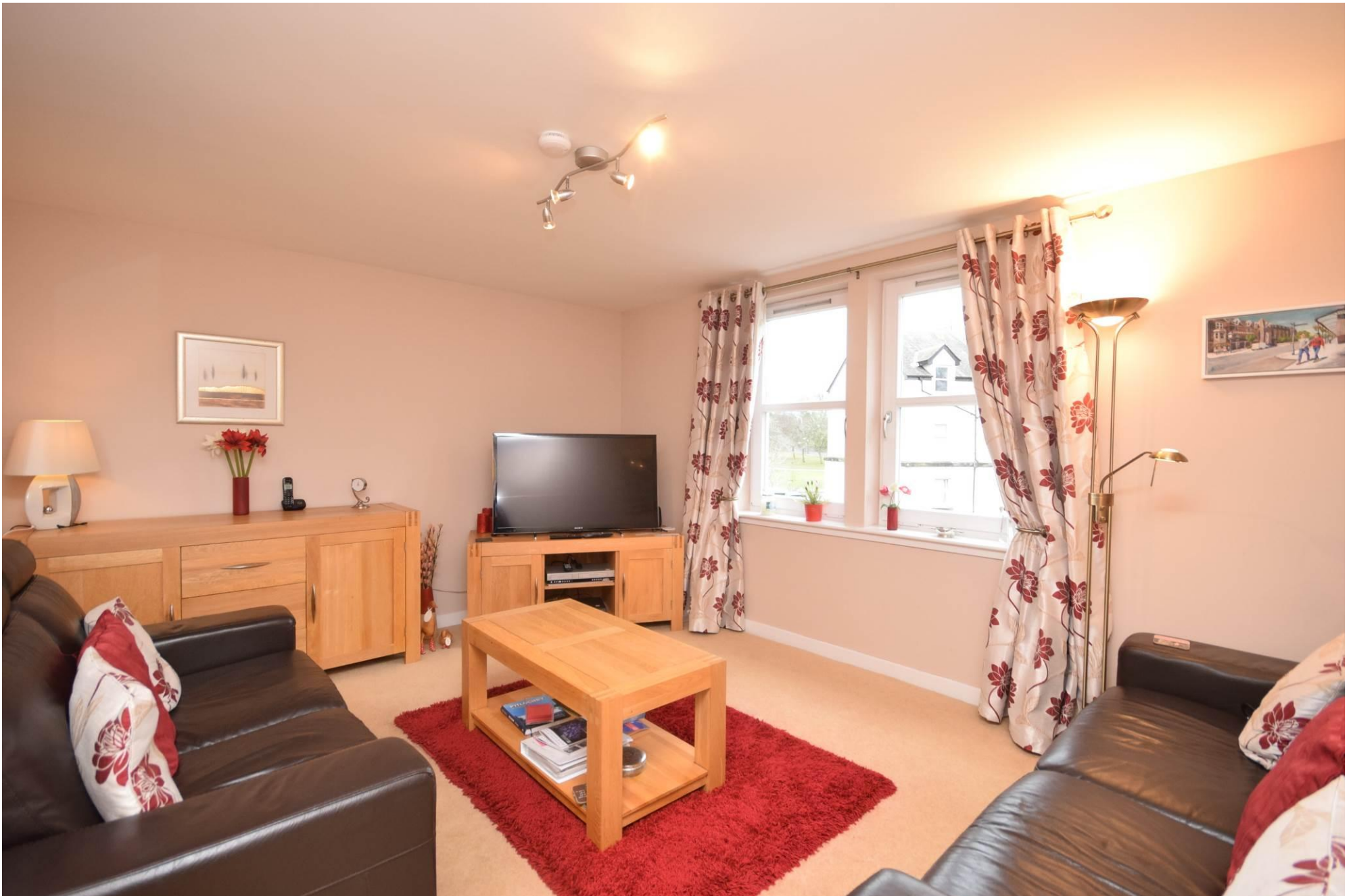
15 Dean Court, Pitlochry, PH16 5NW - Lounge