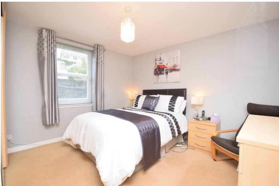
15 Dean Court, Pitlochry, PH16 5NW - Bedroom 1