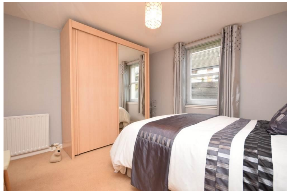
15 Dean Court, Pitlochry, PH16 5NW - Bedroom 1