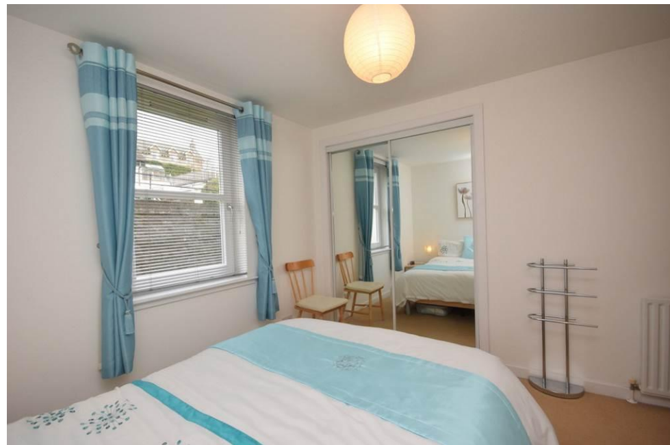
15 Dean Court, Pitlochry, PH16 5NW - Bedroom 2