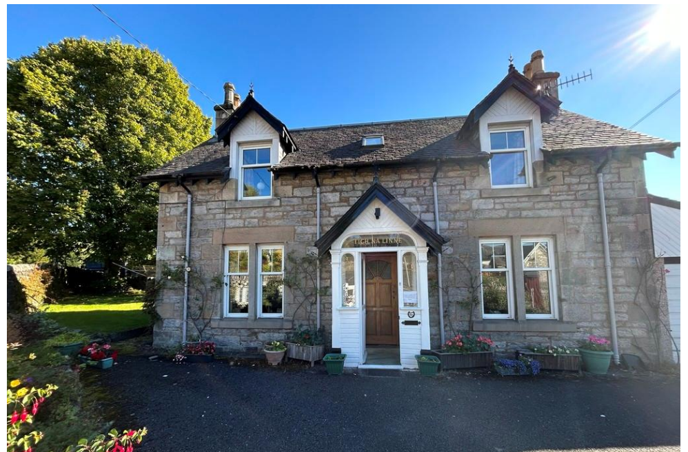
Next Home - Tigh Na Linne, 16 West Moulin Road, Pitlochry, PH16 5EA