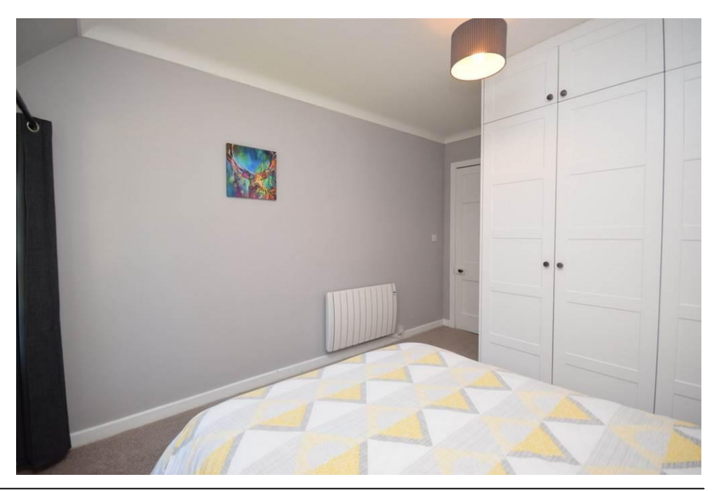
Next Home - Arch House , Dunira, Comrie, Crieff, PH6 2JZ