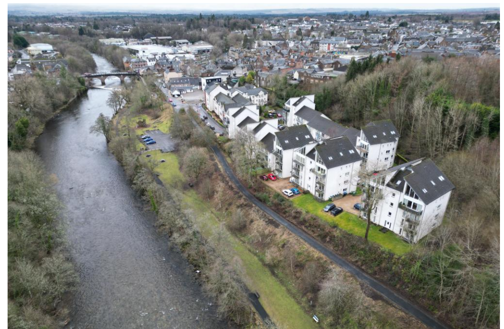
Next Home - 60 Riverside Park, Blairgowrie, PH10 6GB