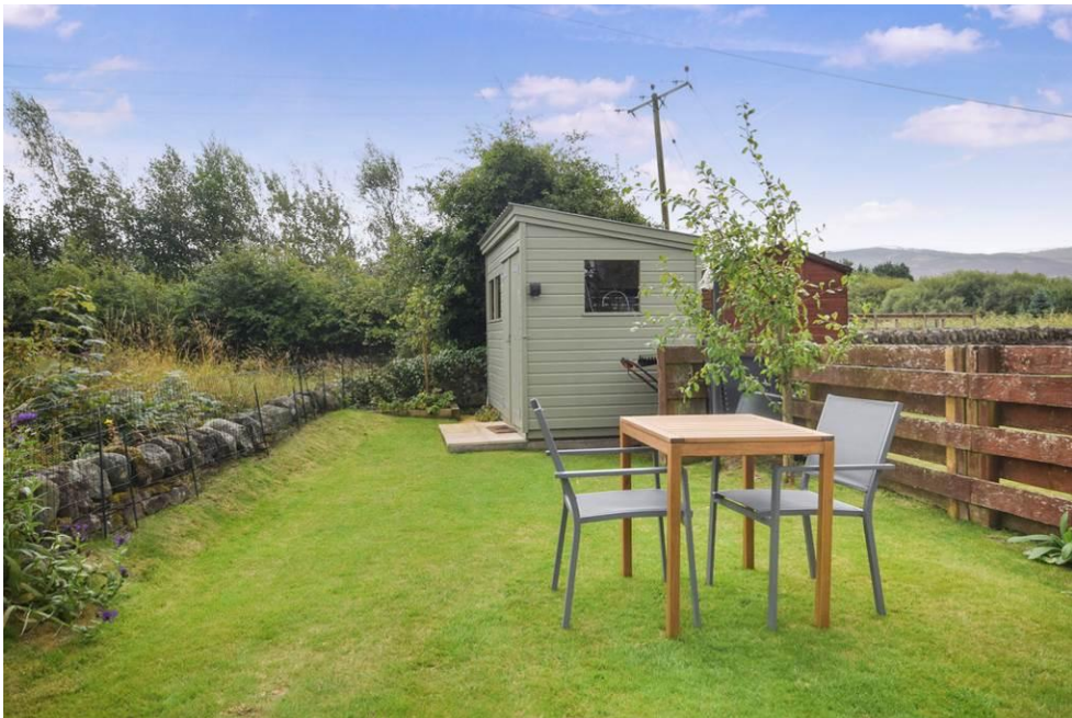
Next Home - Rosenford, Stirling Street, Blackford, Auchterarder, PH4 1QA