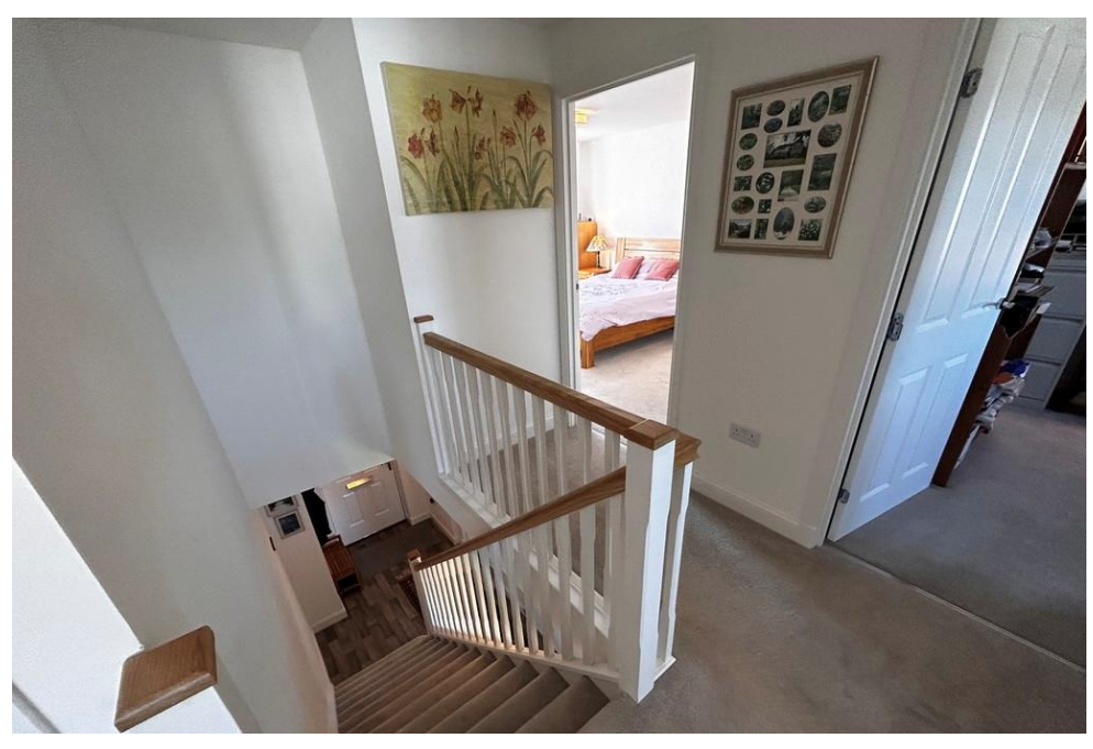
Next Home - 66 Preta Street, Huntingtower, Perth, PH1 3YB