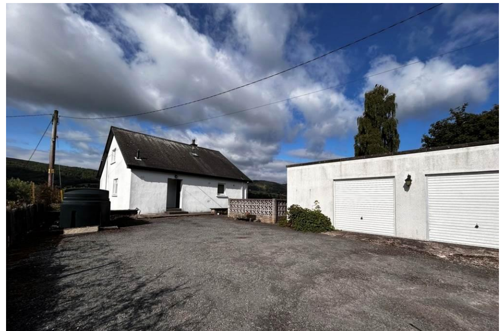
Next Home - Garlyne, Aldour, Perth Road, Pitlochry, PH16 5LY