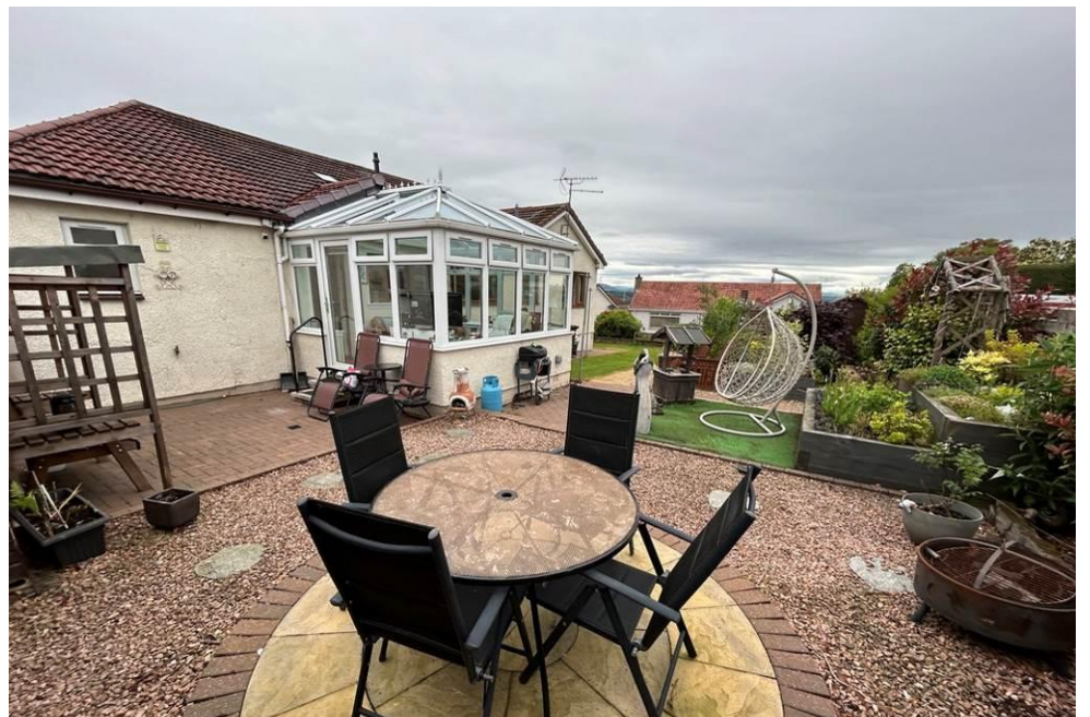
Next Home - 3 Mount Blair View, Perth, PH1 1RE