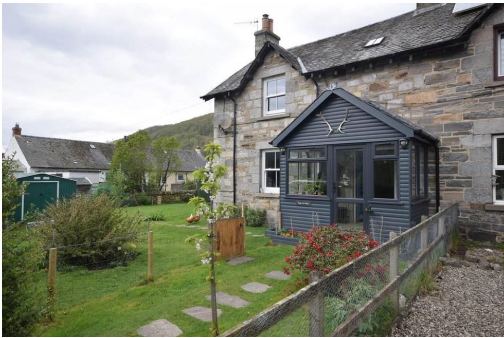
Next Home - Tigh Na Sithe, Kinloch Rannoch, Pitlochry, PH16 5PW