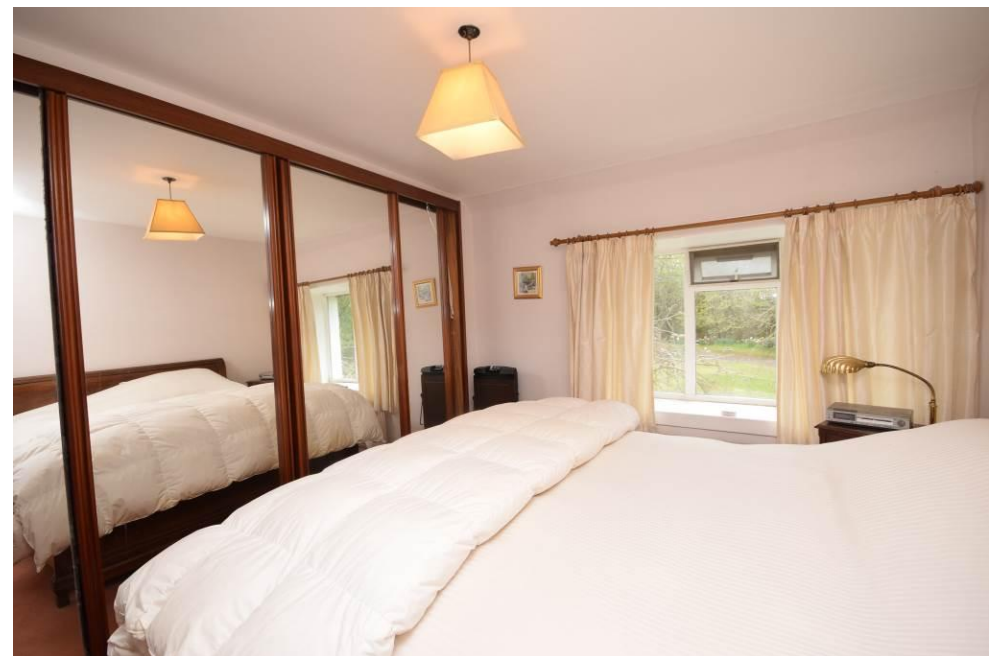
Next Home - 1 Fish Pond Cottage, Stormontfield, Perth, PH2 6BJ