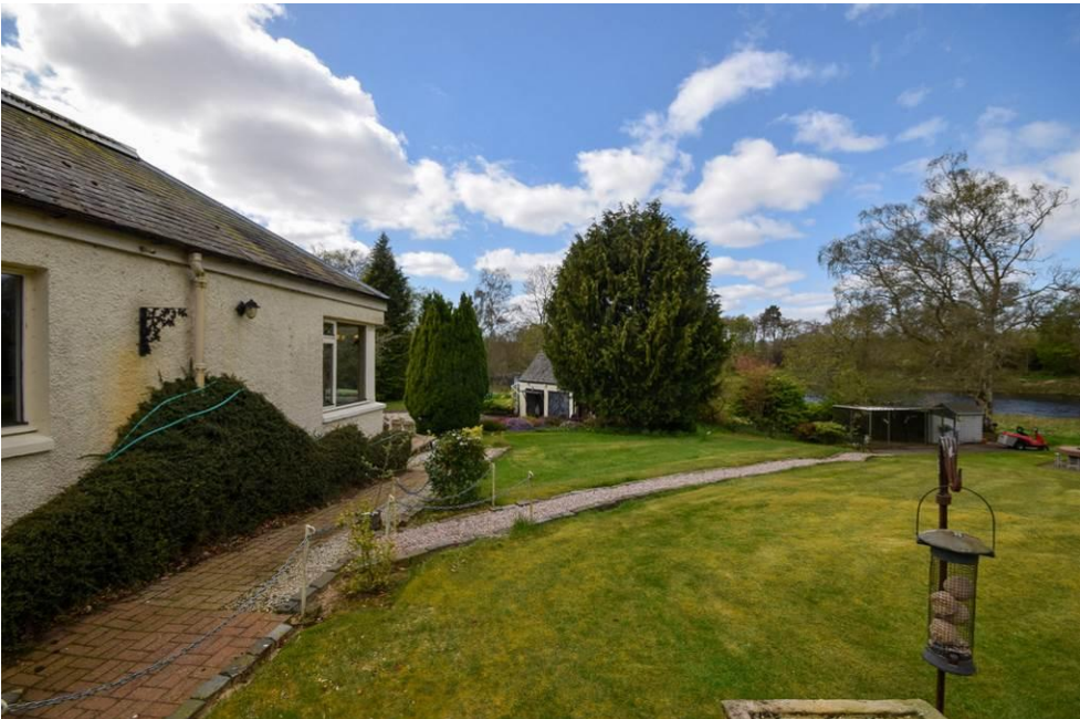
Next Home - 1 Fish Pond Cottage, Stormontfield, Perth, PH2 6BJ