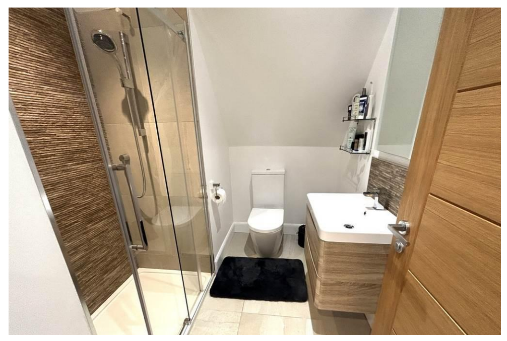
Next Home - Sonas, Pitlochry, PH16 5JT