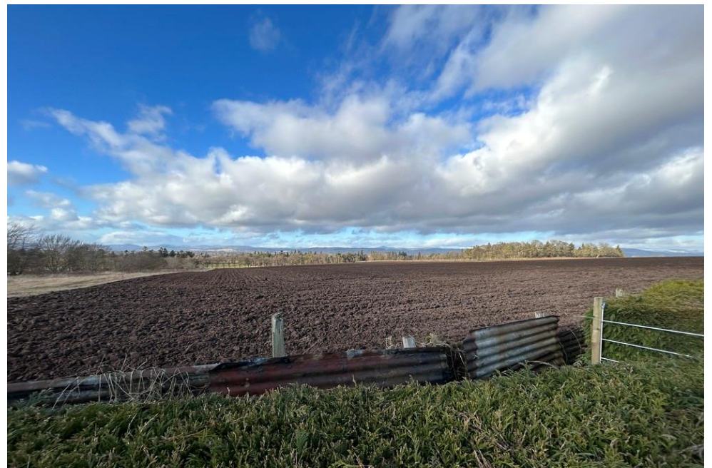
Next Home - Strathview, Leys of Hallyburton, Coupar Angus, Blairgowrie, PH13 9JX