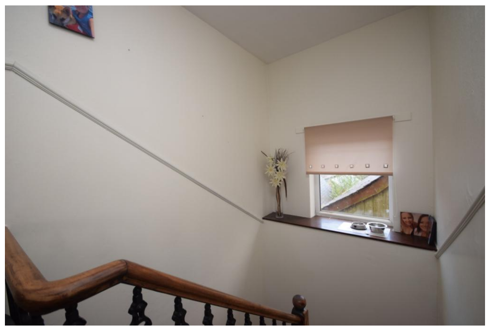
Next Home - 7 Causewayend, Coupar Angus, Blairgowrie, PH13 9DP