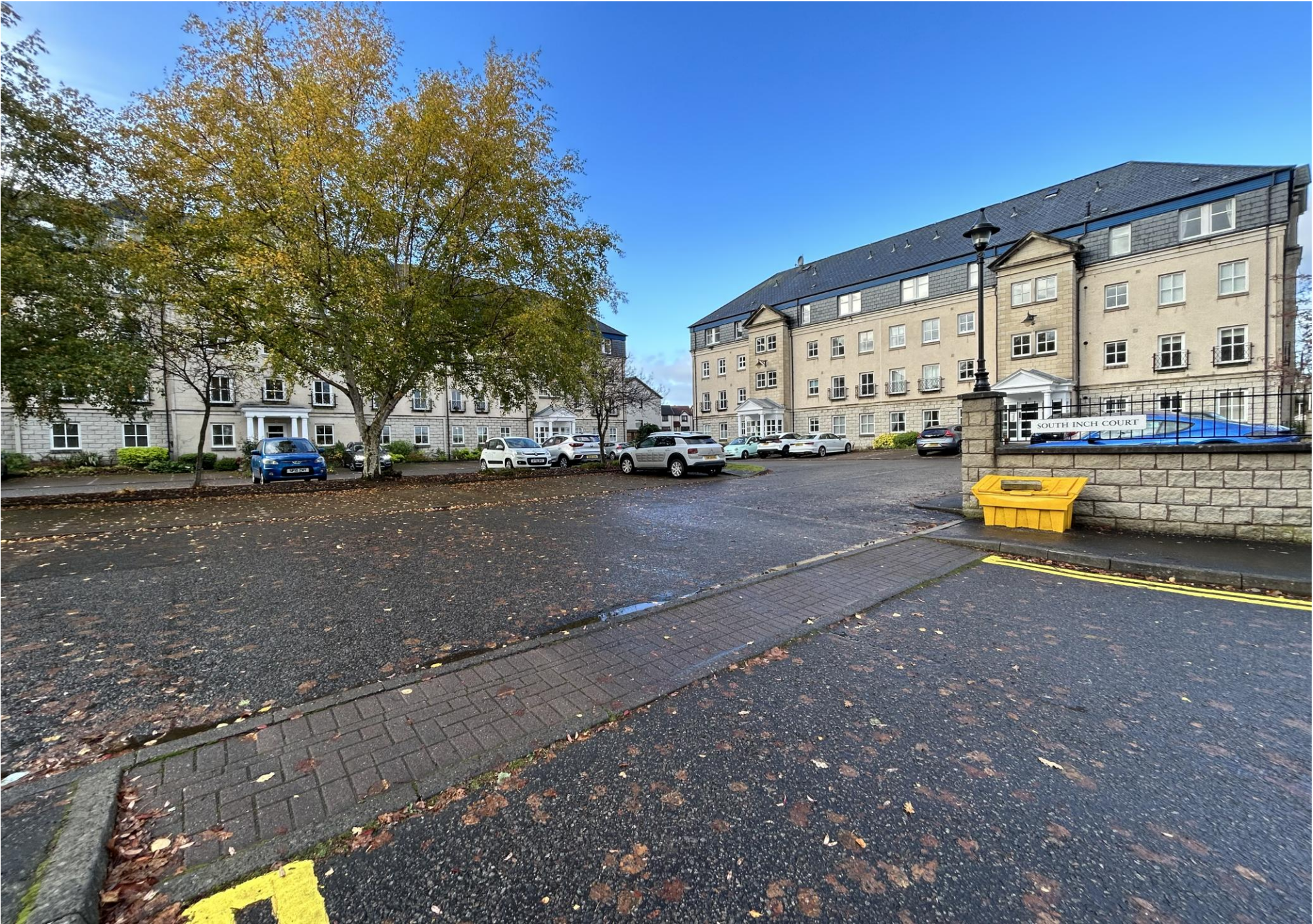
Next Home - 2F South Inch Court, Perth, PH2 8BG