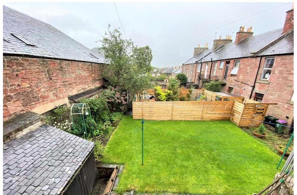
Next Home - 81b Airlie Street, Alyth, Blairgowrie, PH11 8AN