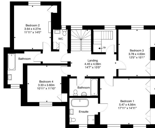
Second Floor Area: approx 41.7 m 2 ... 449 ft 2