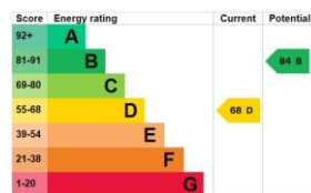
The graph shows this property's current and potential energy rating.

Bedroom two is a good size double with upvc double glazed window to the rear aspect of the property. There is also a radiator.