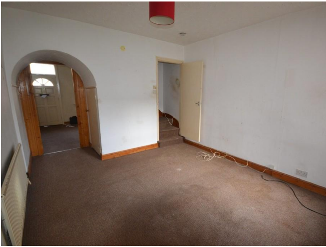
LIVING ROOM 12' 11" x 11' 0" (3.94m x 3.35m)