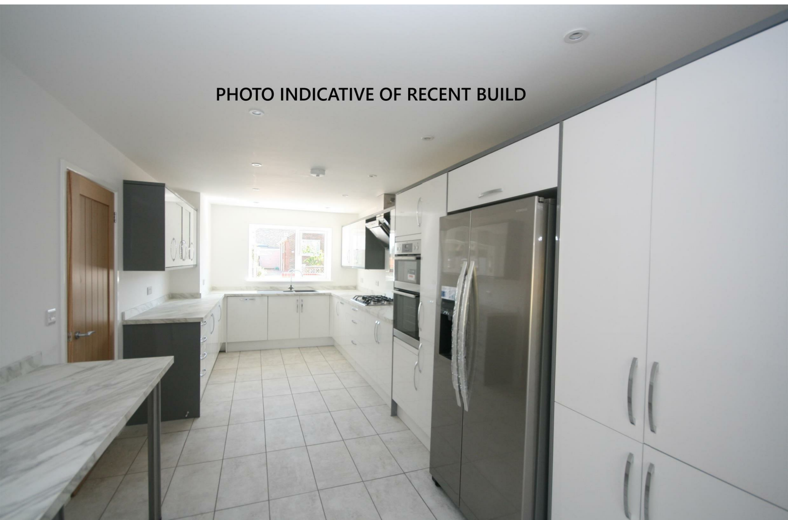
PHOTO INDICATIVE OF RECENT BUILD