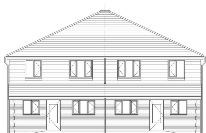
FRONT ELEVATION (EAST)