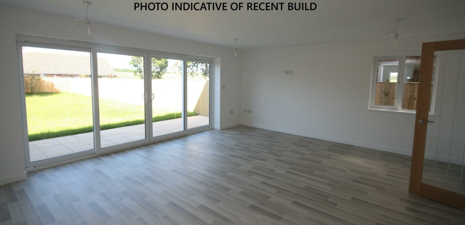
PHOTO INDICATIVE OF RECENT BUILD