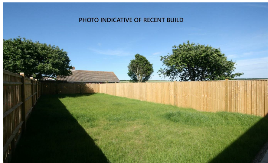
PHOTO INDICATIVE OF RECENT BUILD

Externally a sunny west facing rear garden which has lots of space for all the family to play, relax and entertain. This incorporates a good size patio and a lawn area enclosed by timber fencing. Off road parking is available to the front of the property for two vehicles.