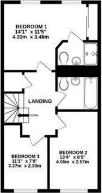
TOTAL FLOOR AREA : 1010 sq.ft. (93.9 sq.m.) approx.