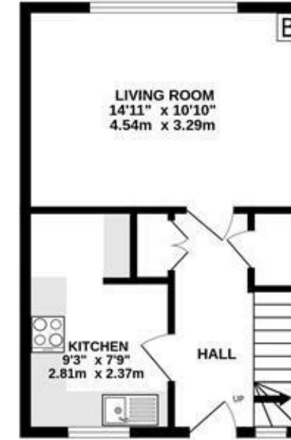
1ST FLOOR 391 sq.ft. (36.3 sq.m.) approx.