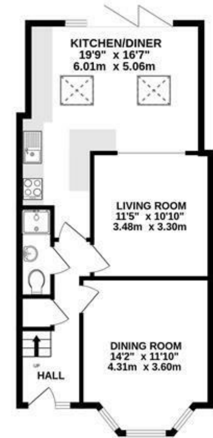
GROUND FLOOR 609 sq.ft. (56.6 sq.m.) approx.