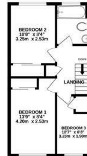
TOTAL FLOOR AREA : 1376 sq.ft. (127.8 sq.m.) approx.

Whilst every attempt has been made to ensure the accuracy of the floorplan contained here, measurements of doors, windows, rooms and any other items are approximate and no responsibility is taken for any error, omission or mis-statement. This plan is for illustrative purposes only and should be used as such by any prospective purchaser. The services, systems and appliances shown have not been tested and no guarantee as to their operability or efficiency can be given. Made with Metropix ©2024