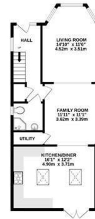
1ST FLOOR 405 sq.ft. (37.6 sq.m.) approx.