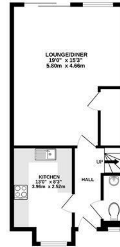
1ST FLOOR 455 sq.ft. (42.3 sq.m.) approx.