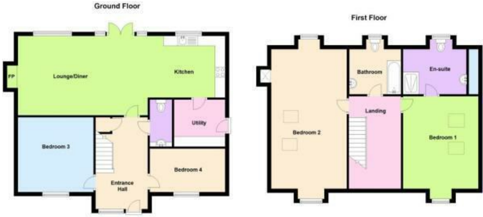
This plan is for illustrative purposes only and should not be used as such by any prospective purchaser. Measurements of doors, windows, rooms and any other items are approximate. The floor areas are approximate and include carport, garage and workshop on the ground floor. Plan produced using PlanUp.

Our particulars are designed to give a fair description of the property, but if there is any point of special importance to you we will be pleased to check the information for you. None of the appliances or services have been tested, should you require to have tests carried out, we will be happy to arrange this for you. Nothing in these particulars is intended to indicate that any carpets or curtains, furnishings or fittings, electrical goods (whether wired in or not), gas fires or light fitments, or any other fixtures not expressly included, are part of the property offered for sale.