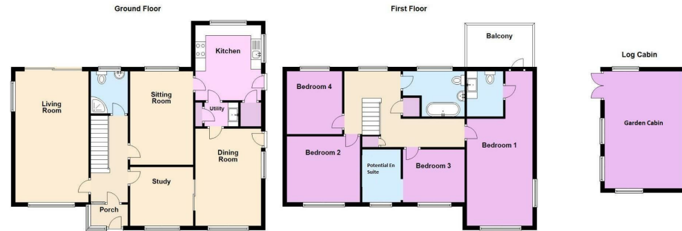
SKETCH PLAN FOR ILLUSTRATIVE PURPOSES ONLY. All measurements are approximate. Plan produced using Planity.

Agents Note Our particulars are designed to give a fair description of the property, but if there is any point of special importance to you we will be pleased to check the information for you. None of the appliances or services have been tested, should you require to have tests carried out, we will be happy to arrange this for you. Nothing in these particulars is intended to indicate that any carpets or curtains, furnishings or fittings, electrical goods (whether wired in or not), gas fires or light fittings, or any other fixtures not expressly included, are part of the property offered for sale.