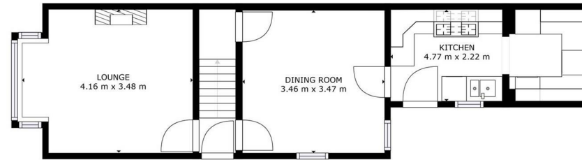
FLOOR 1 GROSS INTERNAL AREA FLOOR 1: 41 m 2 , FLOOR 2: 39 m 2 TOTAL: 80 m 2 SIZES AND DIMENSIONS ARE APPROXIMATE, ACTUAL MAY VARY.

Our particulars are designed to give a fair description of the property, but if there is any point of special importance to you we will be pleased to check the information for you. None of the appliances or services have been tested, should you require to have tests carried out, we will be happy to arrange this for you. Nothing in these particulars is intended to indicate that any carpets or curtains, furnishings or fittings, electrical goods (whether wired in or not), gas fires or light fittings, or any other fixtures not expressly included, are part of the property offered for sale.