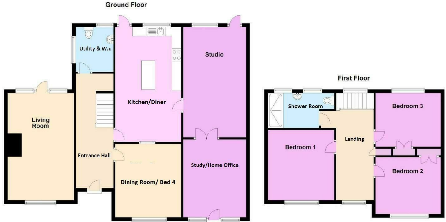
SKETCH PLAN FOR ILLUSTRATIVE PURPOSES ONLY All measurements are approximate. Plan produced using PlanUp.

Our particulars are designed to give a fair description of the property, but if there is any point of special importance to you we will be pleased to check the information for you. None of the appliances or services have been tested, should you require to have tests carried out, we will be happy to arrange this for you. Nothing in these particulars is intended to indicate that any carpets or curtains, furnishings or fittings, electrical goods (whether wired in or not), gas fires or light fitments, or any other fixtures not expressly included, are part of the property offered for sale.