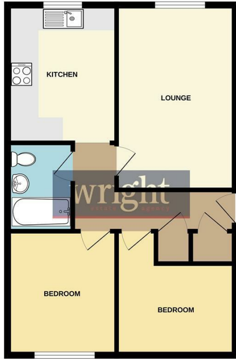
GROUND FLOOR 580 sq.ft. (53.9 sq.m.) approx.

TOTAL FLOOR AREA: 580 sq.ft. (53.9 sq.m.) approx.