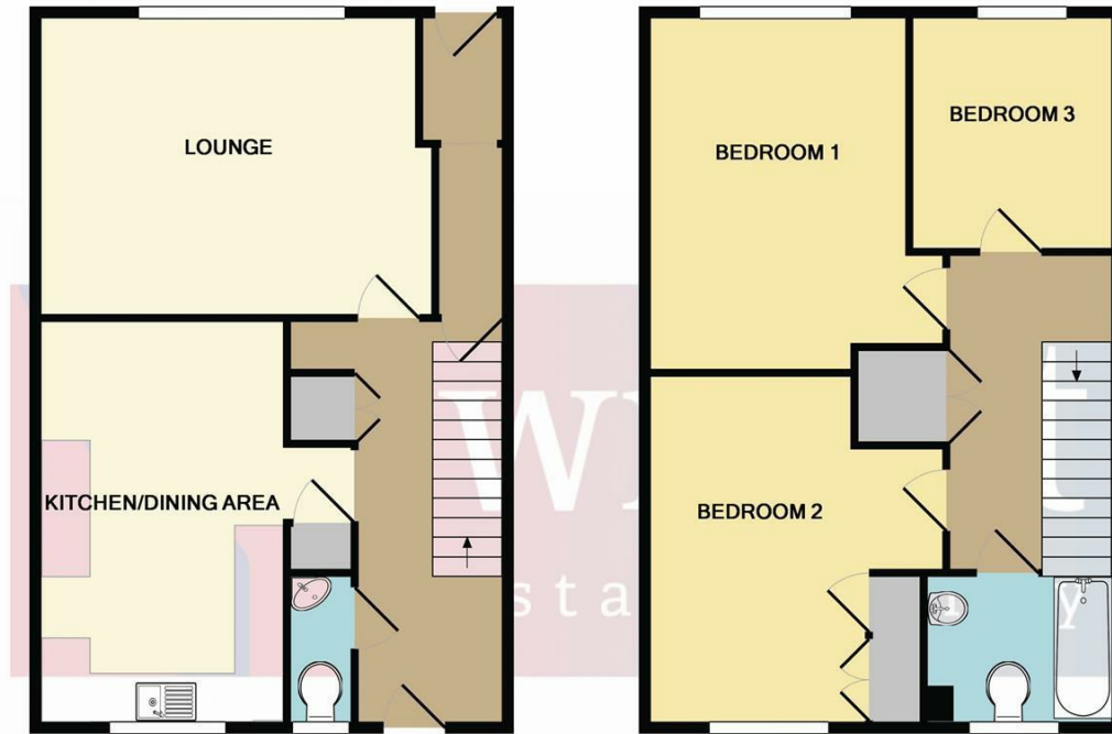
GROUND FLOOR APPROX. FLOOR AREA 560 SQ.FT. (52.0 SQ.M.)