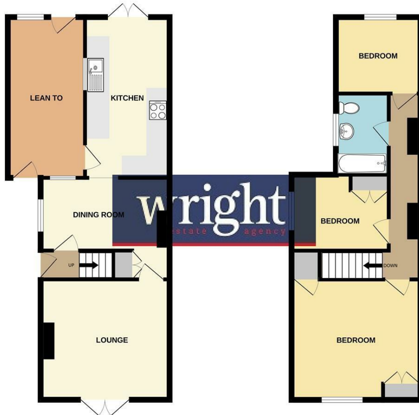
1ST FLOOR 435 sq.ft. (40.4 sq.m.) approx.

TOTAL FLOOR AREA: 998 sq.ft. (92.7 sq.m.) approx. Whilst every attempt has been made to ensure the accuracy of the floorplan contained here, measurements of doors, windows, rooms and any other items are approximate and no responsibility is taken for any error, omission or mis-statement. The plan is for illustrative purposes only and should be used as such by any prospective purchaser. The services, systems and appliances shown have not been tested and no guarantee as to their operability or efficiency can be given. Made with Metropix ©2023