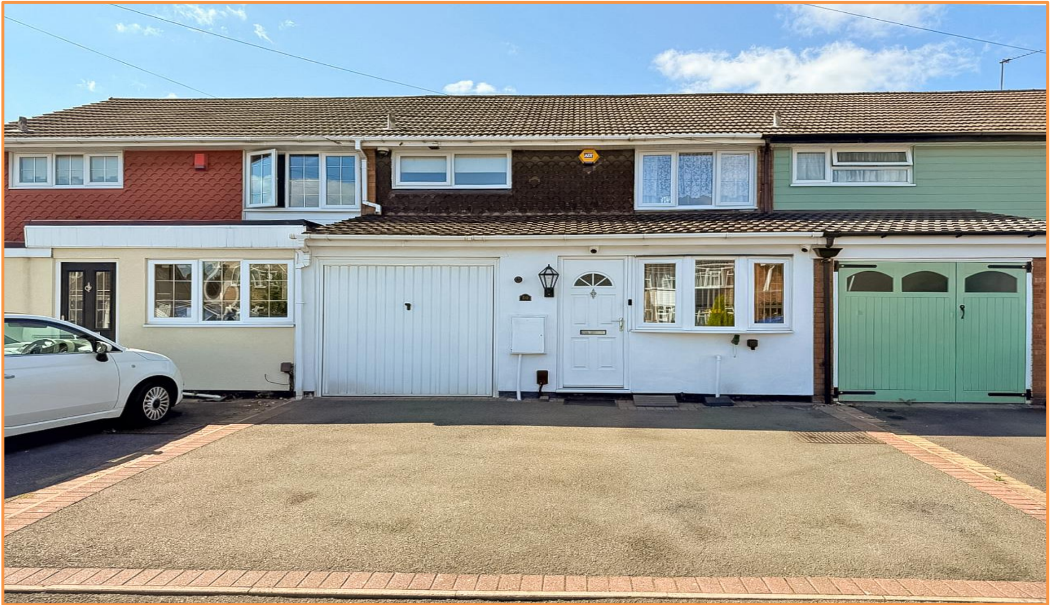
The Hayes, Willenhall, WV12 4RU