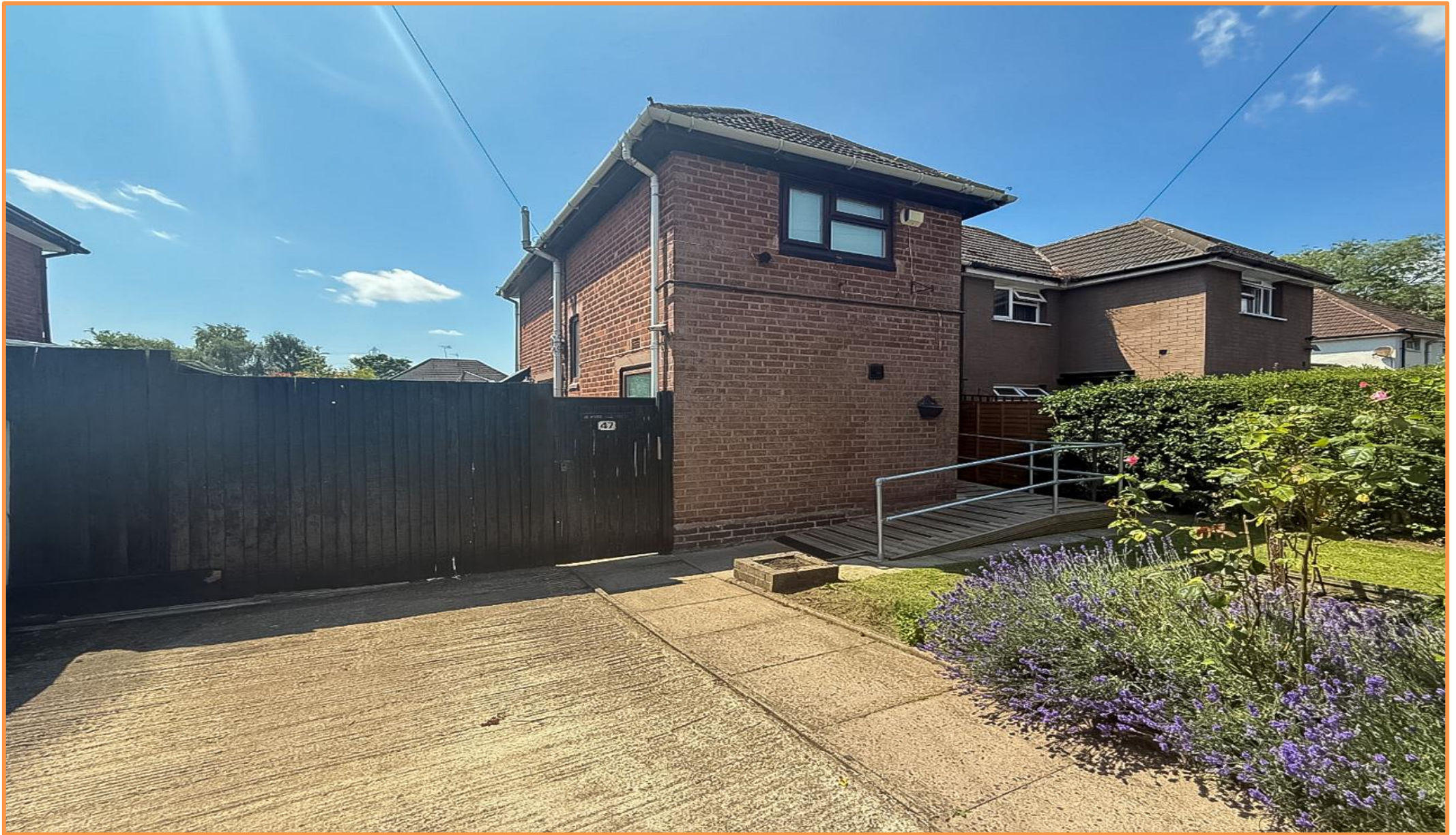
King Charles Avenue, Bentley Walsall, WS2 0DL