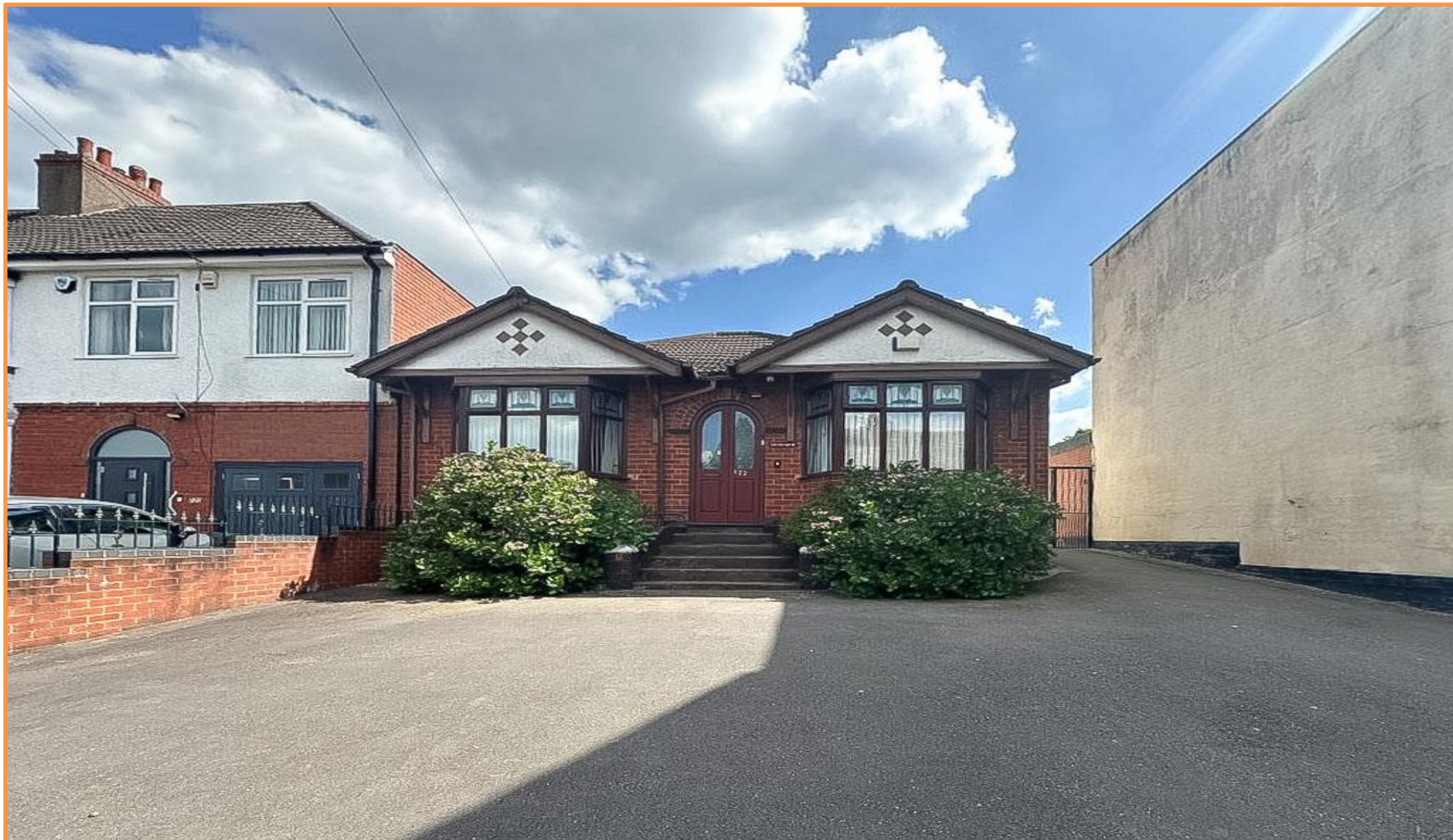
Gipsy Lane, Willenhall, WV13 2HG