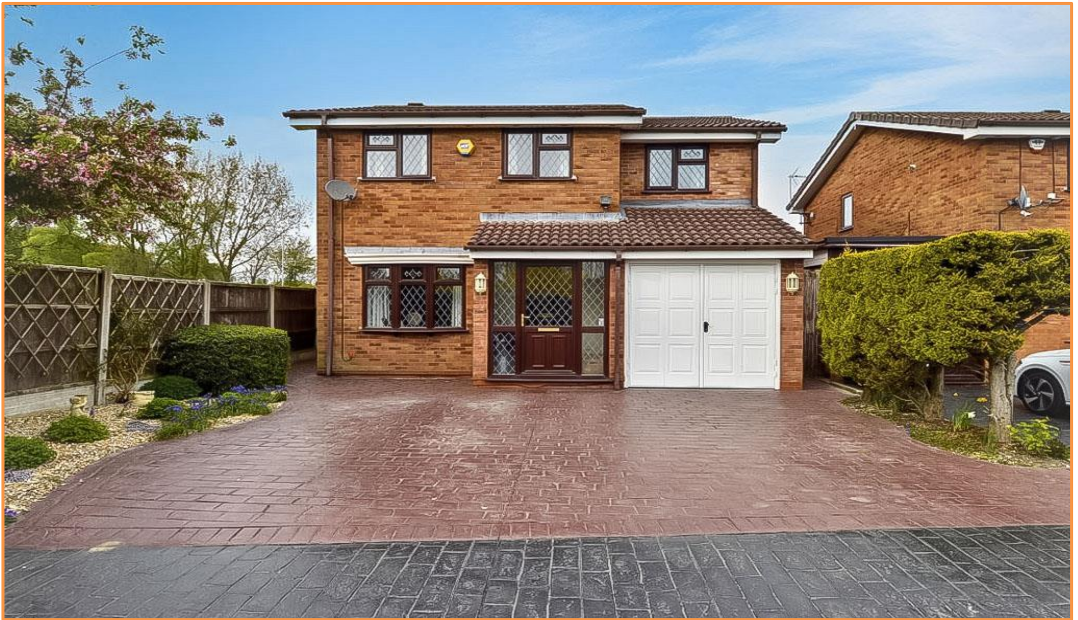
Highmoor Close, Coppice Farm Estate Willenhall, WV12 5UU