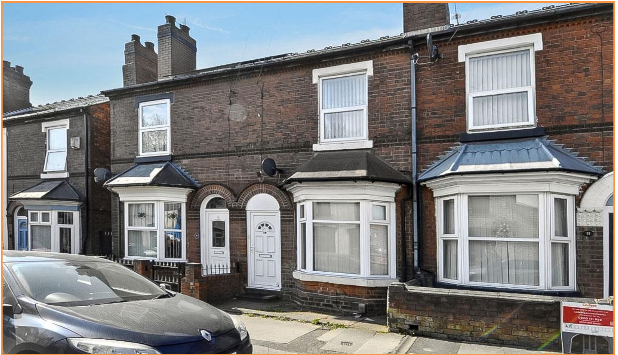
St. Annes Road, Willenhall, WV13 1ED