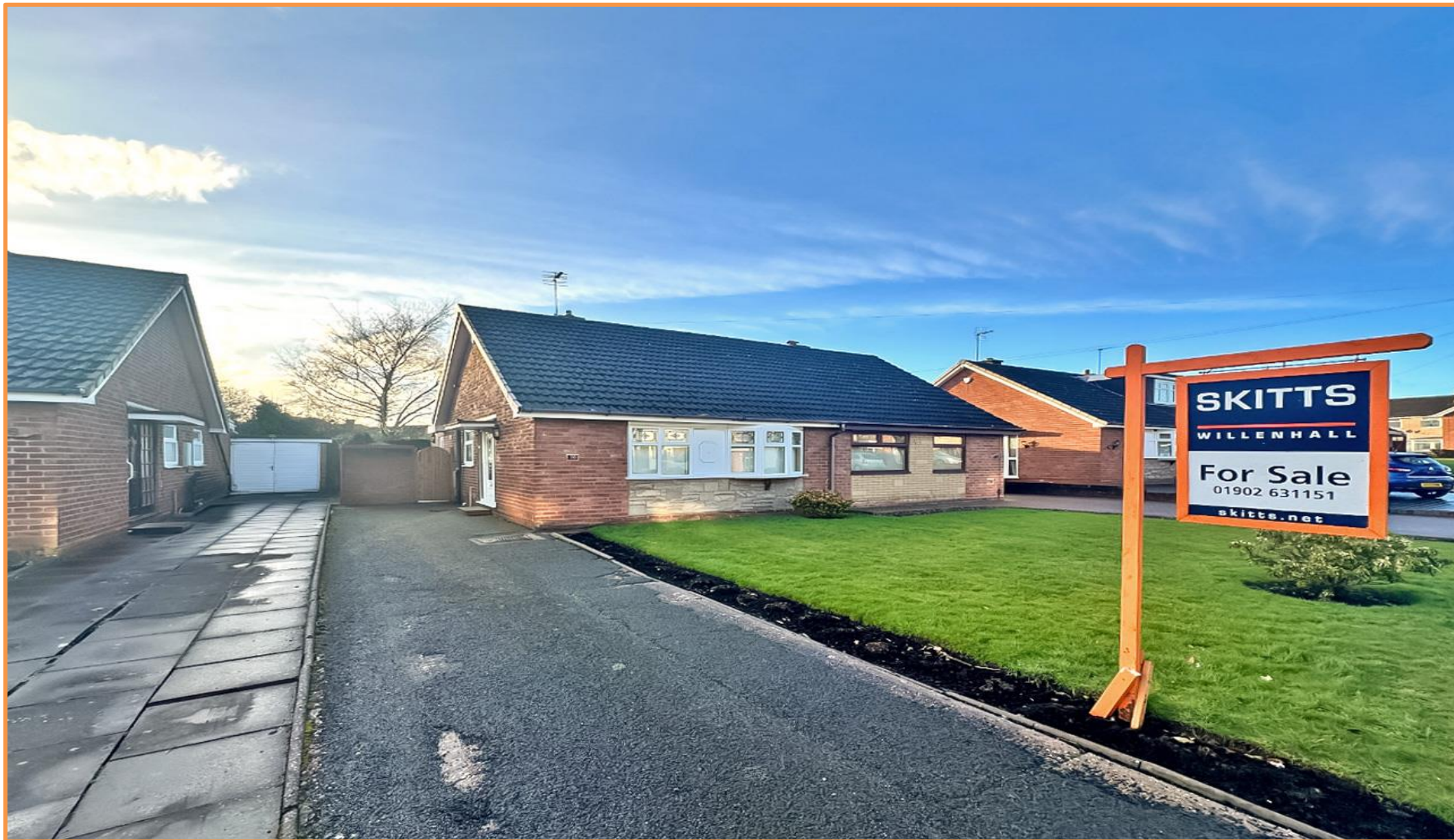
Linden Lane, Willenhall, WV12 5NX