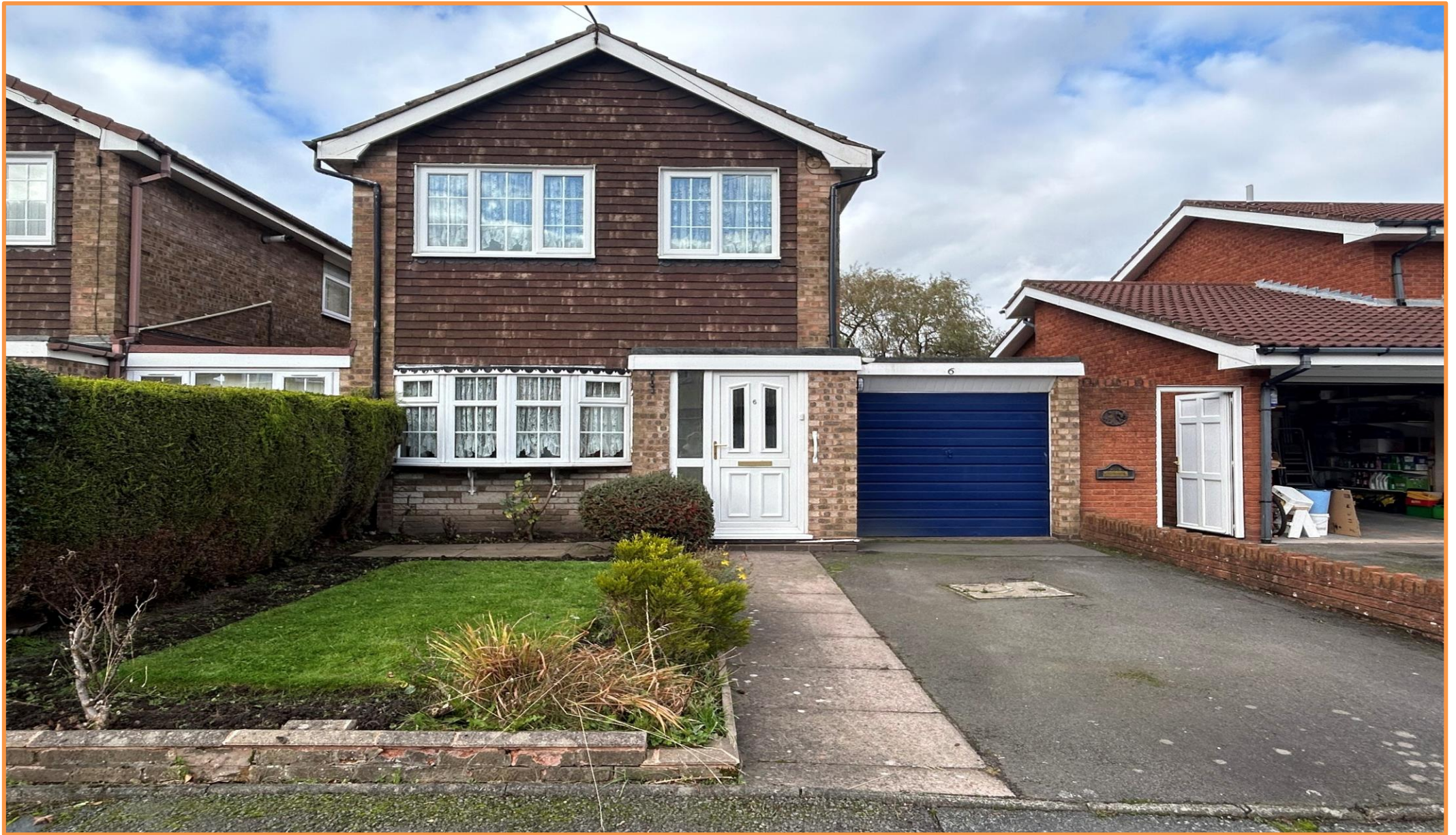
Broadmeadows Close, Willenhall, WV12 5JW