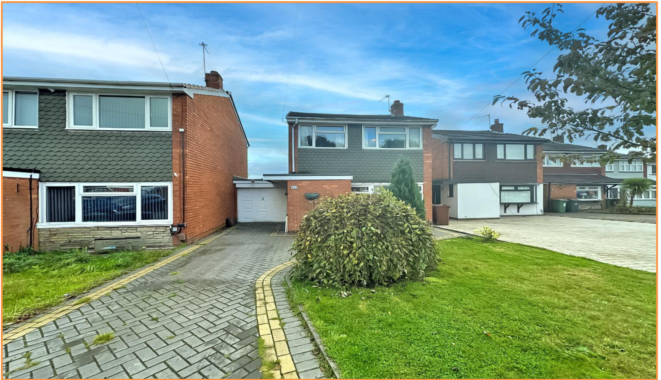
Stonehouse Avenue, Willenhall, WV13 1AP