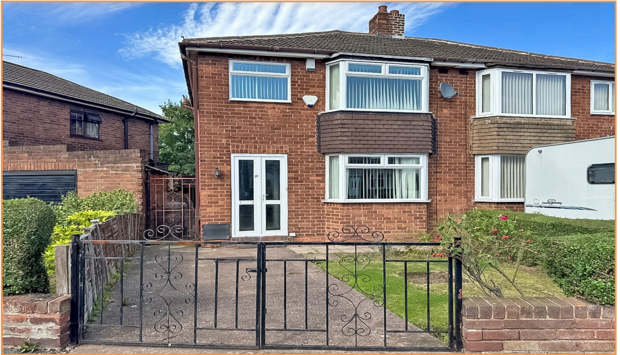
Five Oaks Road, Portobello Willenhall, WV13 3JS