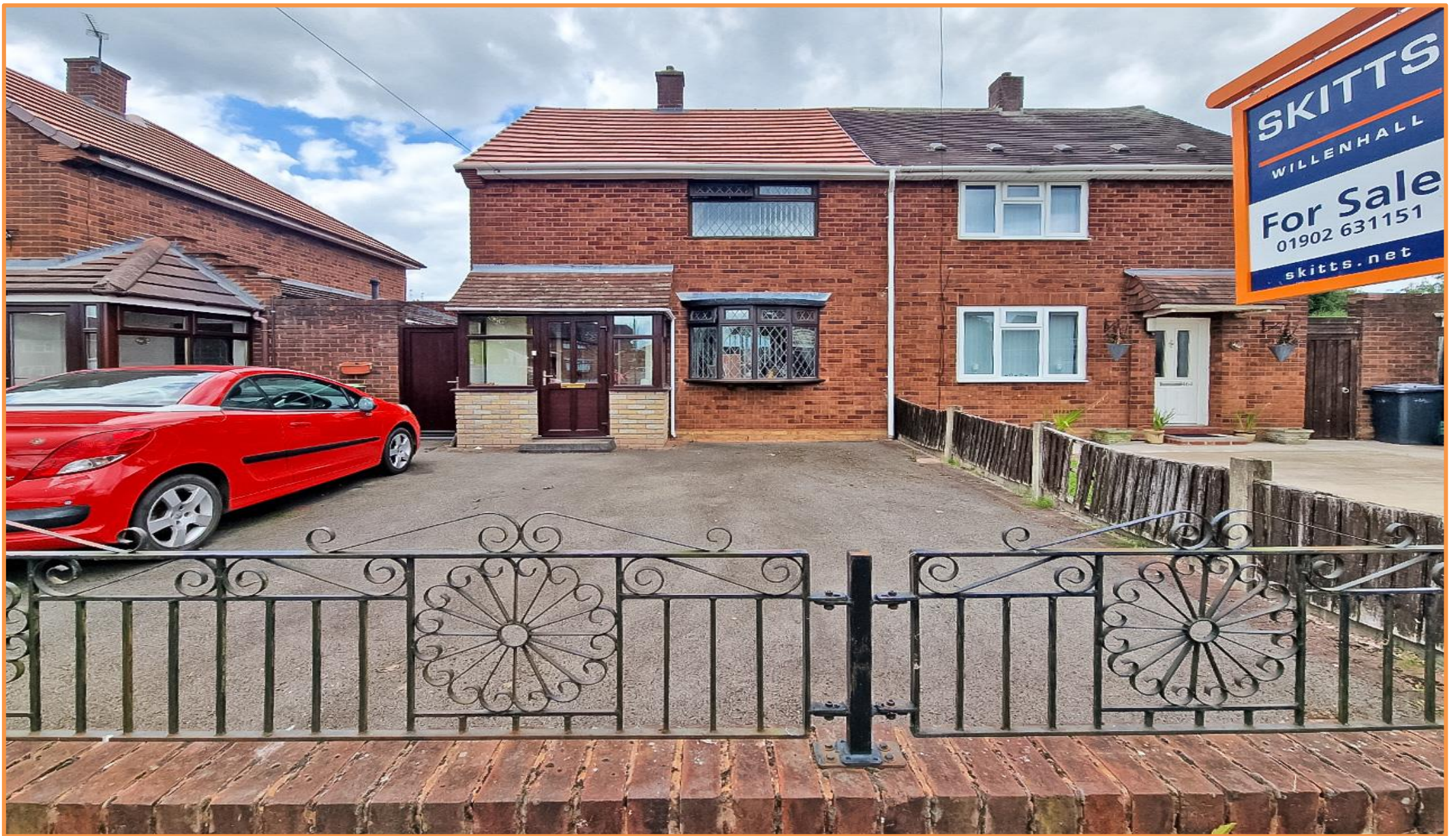
Griffiths Drive, Wednesfield Wolverhampton, WV11 2LQ