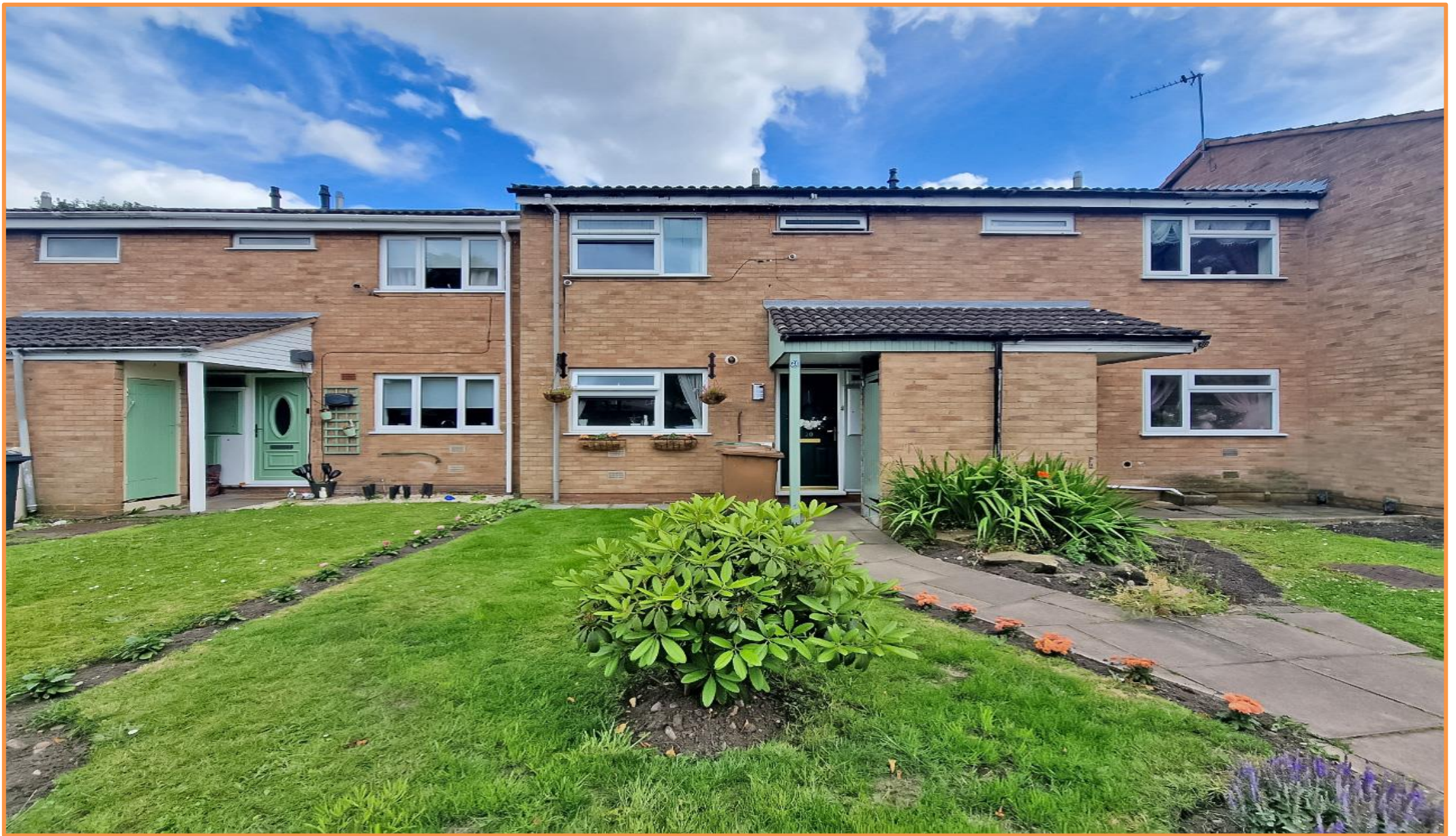
Fairlawn Close, Willenhall, WV12 5XD