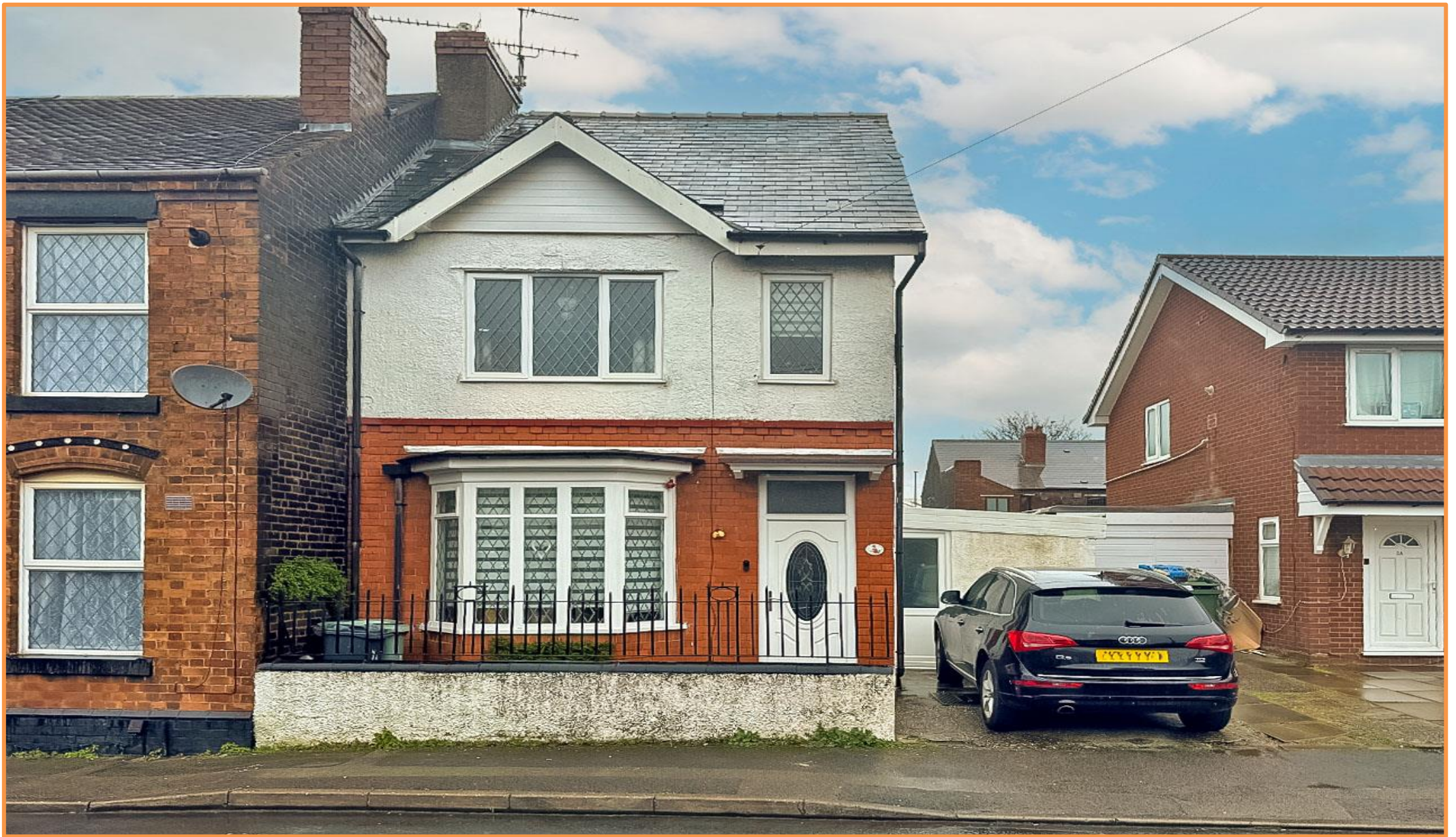
Lodge Street, Willenhall, WV12 4JP