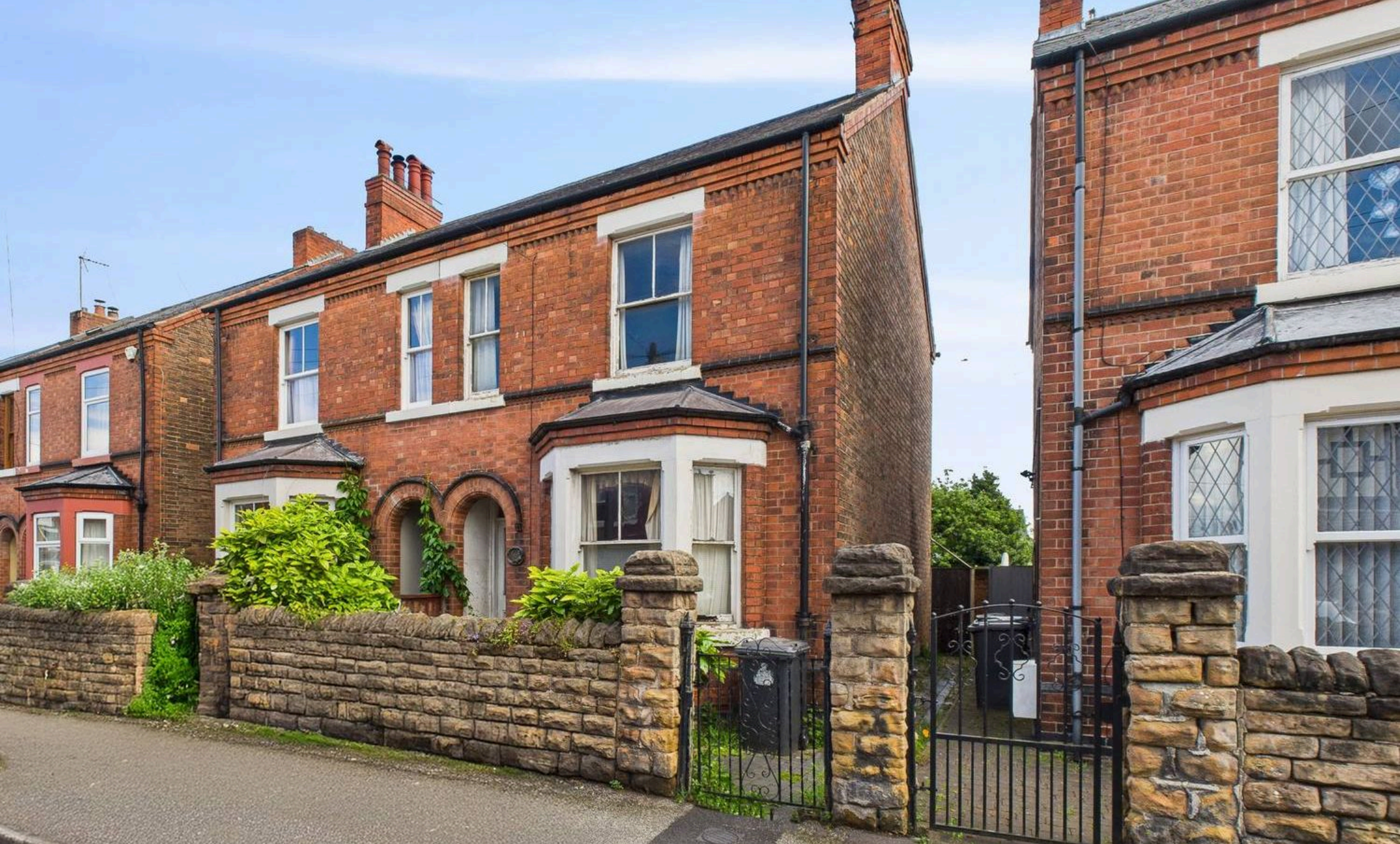
26 Chandos Street, Netherfield – NG4 2LS £165,000