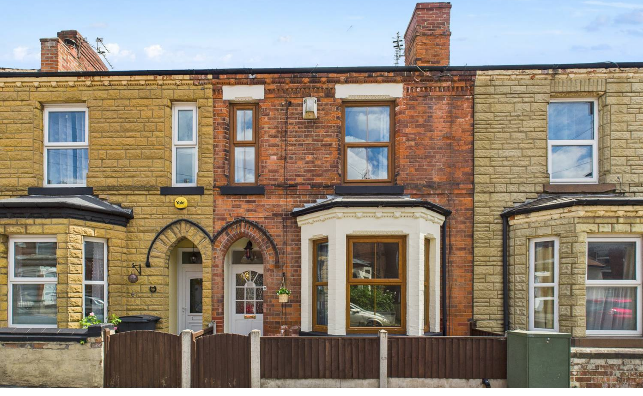
31 Bourne Street, Netherfield - NG4 2FJ Guide Price £210,000