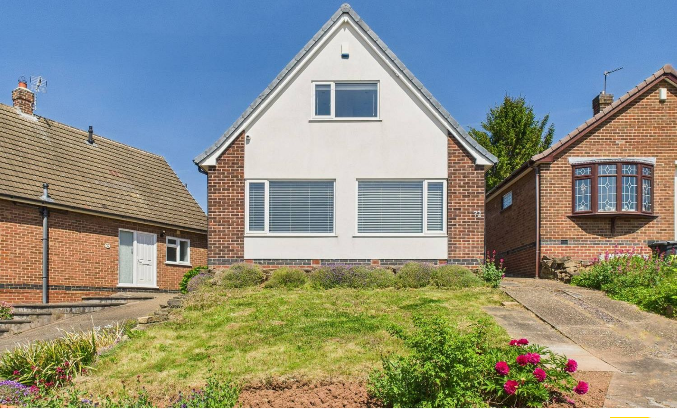
72 Violet Road, Carlton - NG4 3QP Guide Price £300,000